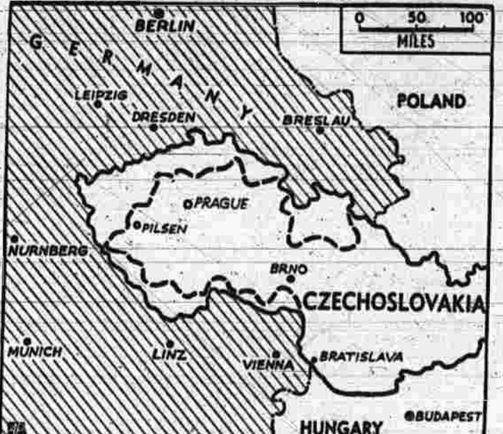
"New Border" for the Czechs

Dotted line in this map shows approximately the border between Germany and Czechoslovakia if the plan, supposedly approved by French and British statesmen in their London conference is approved.